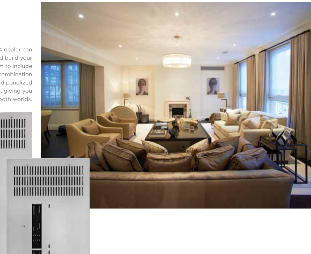
Your Control4 dealer can design and build your lighting system to include the perfect combination of wireless and panelized lighting solutions, giving you the best of both worlds.

With Panelized Lighting solutions from Control4, all dimming, switching and load management is performed by smart lighting modules, tucked away in a panel located in a mechanical room or closet so you can focus entirely on the beauty and not worry about the brains.